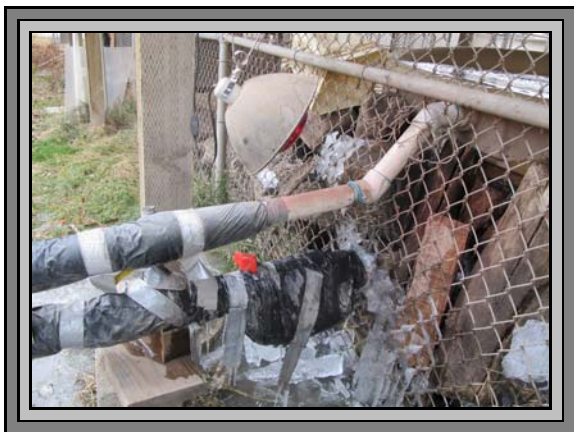
Drain pipe cracked, leaks froze drain pipes & water froze inside swim tub

Each year we face repairs from mischievous bears, but with the swim tub we also face problems with both the drain holes in the tub & the drain pipes freezing. We all know there is no guarantee against freezing as it happens with our own water pipes during winter despite every precaution or