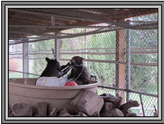
Hey, there's water in here again