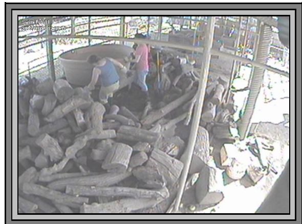
Position swim tub back on frame