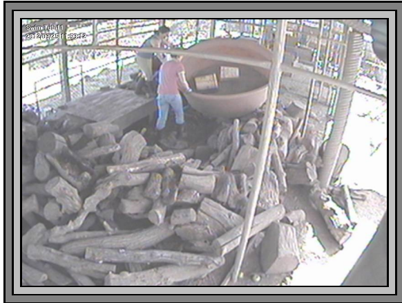
Move tub off frame

After that we needed to move the swim tub about a foot to the right of it's current location. That meant digging out the frame it was sitting on and moving both the frame and tub. Normally we would have waited until we knew if we could put the tub in the ground, but we were plotting to find a way to get a couple of feet of water in the tub for the bears to play in until repairs were completed. Since there was no way to drain it at this time, by moving it so it was tight against the chain link most of the water could just flow out into the pasture with only a little draining back into the enclosure. Amy & Tennyson got the task of doing this job alone. It took all 4 hands so these pictures were taken with the monitor system cameras.