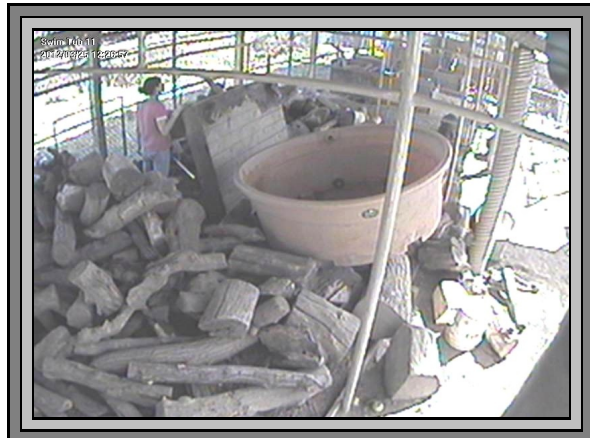
Dig up and move frame