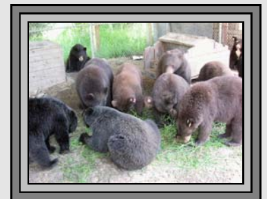
The Bears Thank You!

IBBR is a not-for-profit 501(c)(3) Organization