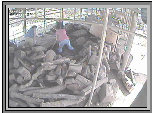
Position frame against the chain link