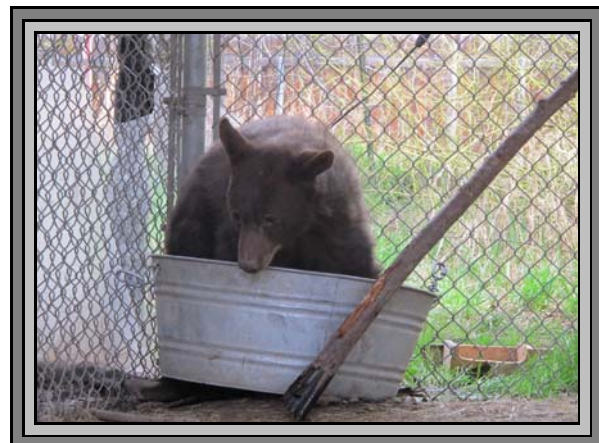
This doesn't work for me. When do we get our swim tub back?

We have two plans for this fix & hope that one of them will be a permanent solution. With bears, it's always a test run. What you are absolutely sure will work, sometimes doesn't. However, after so many years of seeing bears accomplish the impossible, we are comfortable that both plans will work at least for the bears. No one can guarantee pipes won't freeze, but after much discussion and consultation with plumbers and electricians we think we have two good plans in place. Both plans should minimize any chance of freezing either in the tub or the drain pipes and both should prevent mischievous & determined bears from doing any damage. One of them would allow us to partially bury the existing swim tub in the ground and get it off the high frame. That would alleviate concerns about broken legs when bears go lunging in and out of the tub and race down the logs around it. The estimate to fix this for good is upwards of $3000 and while the in-ground solution will cost more, we are very hopeful of donations of materials and labor to bring it within our budget.